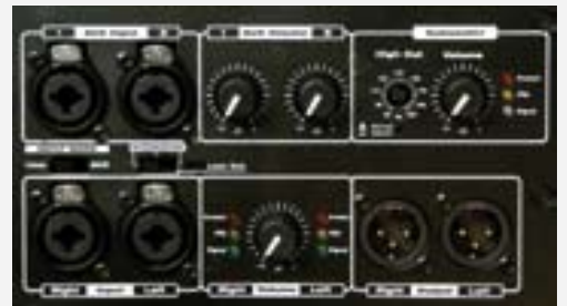
QM1000A Back Panel Detail