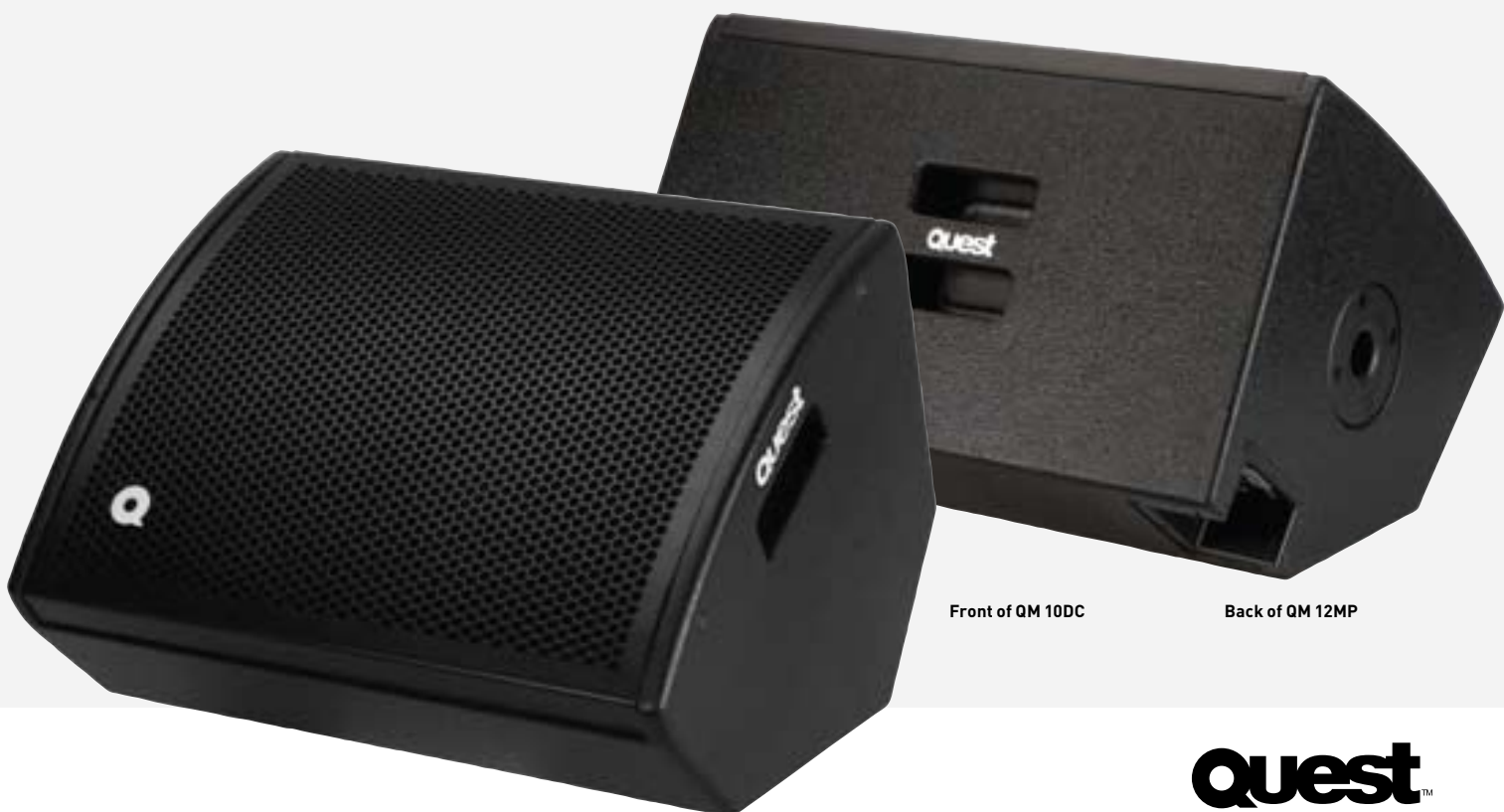
Front of QM 10DC