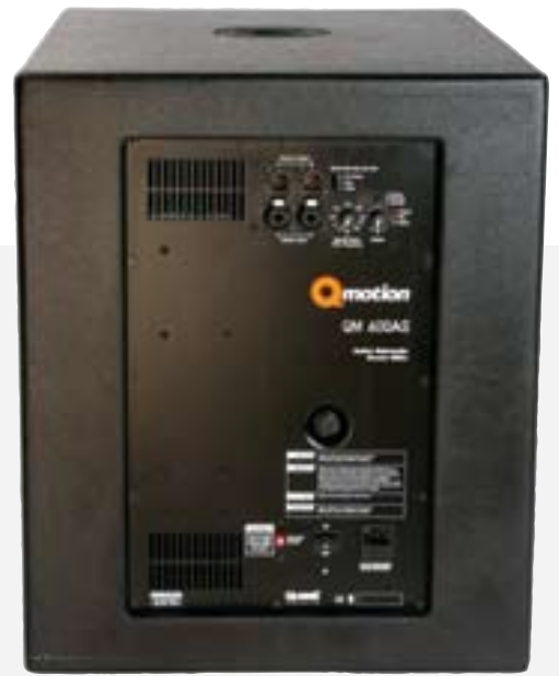
Back of QM 600AS

Alternatively the QM 1000A and QM600AS can power up to any 4 x passive speakers as a mixture of front of house and/or fold-back in either full range or cross-over output mode. A pair of QM 1000 bass modules will give you a total of 4 extra amplifiers you can configure for many combinations of fold-back and front of house configurations. A 35 mm pole mount socket and two side handles completes the package and optional dolly carts and transit covers are available.